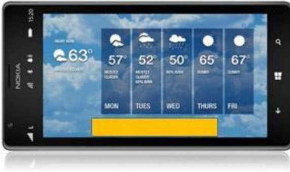
Ads in Apps on Windows Phone